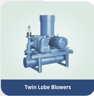
Twin Lobe Blowers

Explore a diverse range of Roots Blower distributors in Singapore for dependable air and gas handling solutions. Our network of distributors offers high-quality Roots Blowers, renowned for their efficiency and reliability in various industrial applications. Count on our partners to deliver top-notch solutions for your specific air and gas handling requirements.