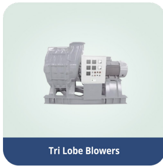
Tri Lobe Blowers